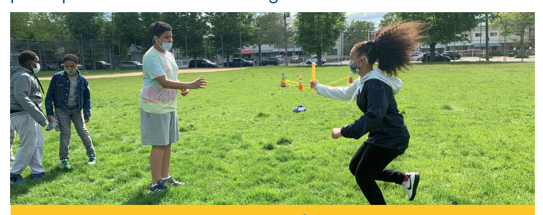
CHOICE Time 5-6pm

Club program's are chosen by members based on interests. Participants sign up for at least 2 Club programs: 1 on Mon, Wed, Fri and 1 on Tue, Thu. Clubs are chosen based on what participants find most interesting.